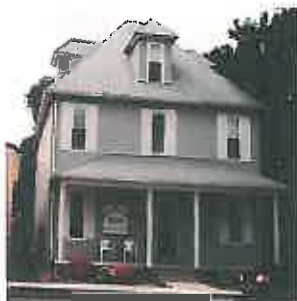
*Randolph County Homeless Shelter in Elkins.